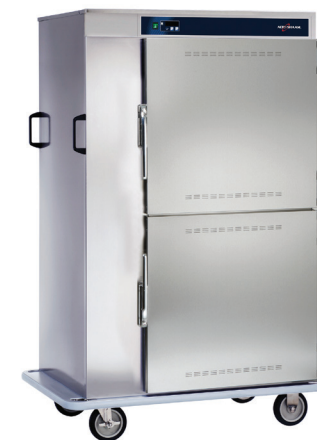
1000-BQ2/96 Shown with split door option