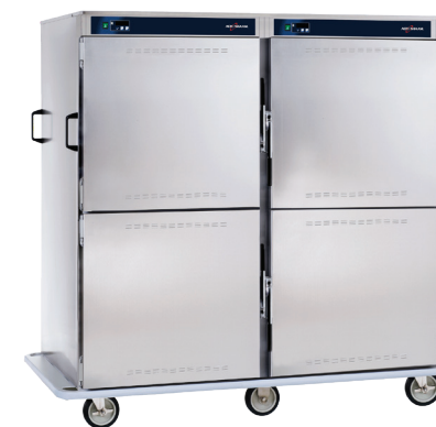
1000-BQ2/192 Shown with split door option